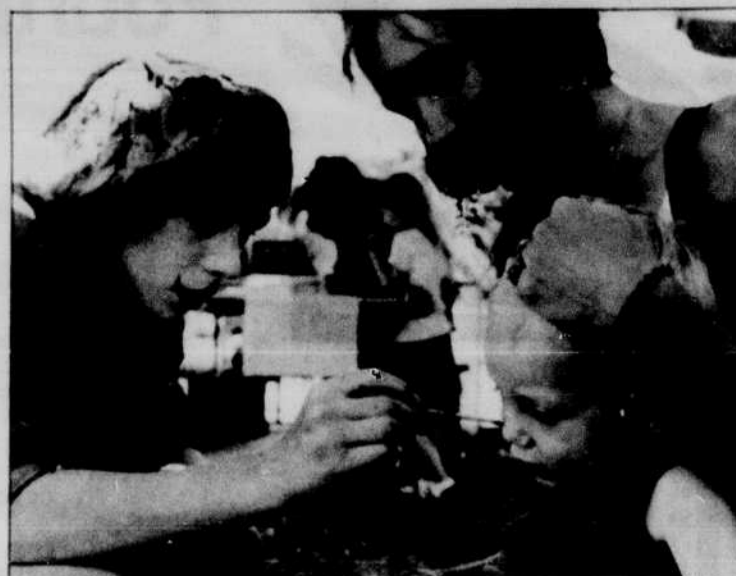
Face painting for the kids and music and wine-tasting for the adults make Art and the Vineyard one of Eugene's unique local celebrations.

If these events aren't frequent enough, or if you don't have a lot of time, Sundance Wine Merchants, 2470 Alder St., offer free wine tastings every Saturday throughout the year from 3 to 6 p.m. The tastings feature