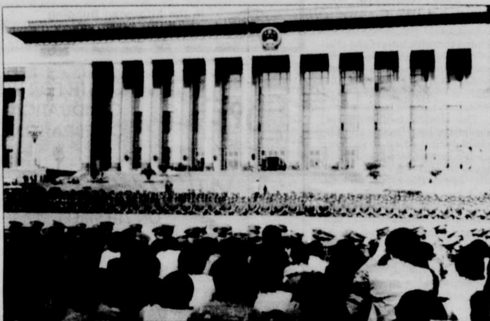
▲ Government troops form a barrier outside the Great Hall of the People to prevent protesters from entering.