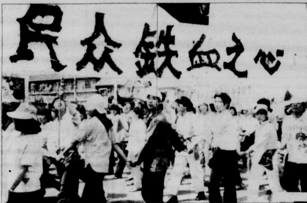
▲ Demonstrators marching with banners proclaiming their solidarity.