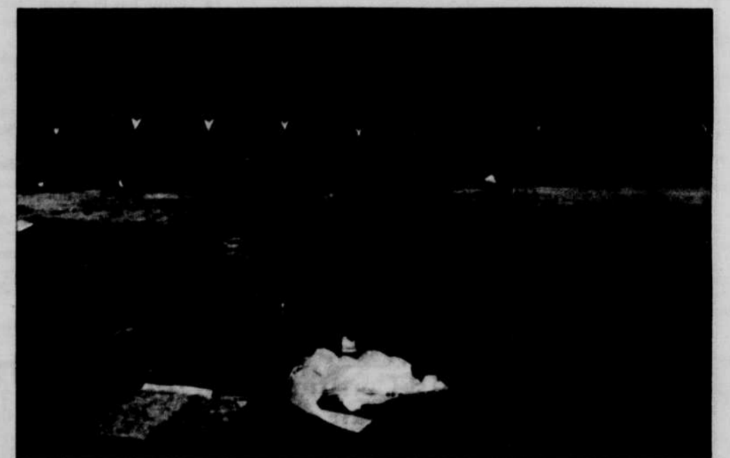
▲ A hunger striker faces soldiers in front of Zhongnanhai.