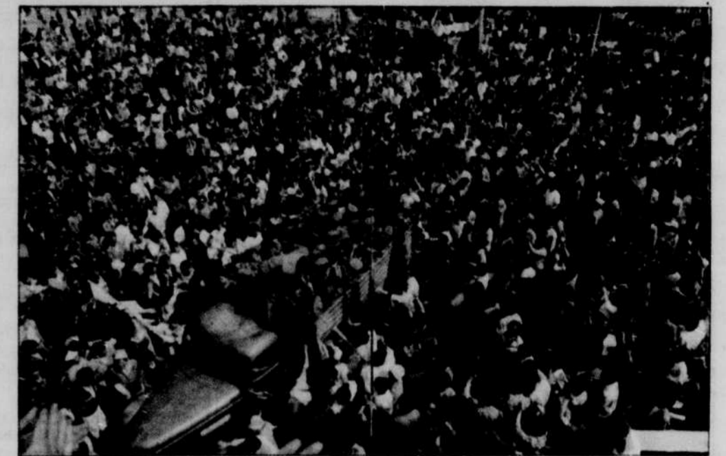
▲ Hours after martial law is declared, a human wall of resistance meets a troop convoy attempting to enter central Beijing.