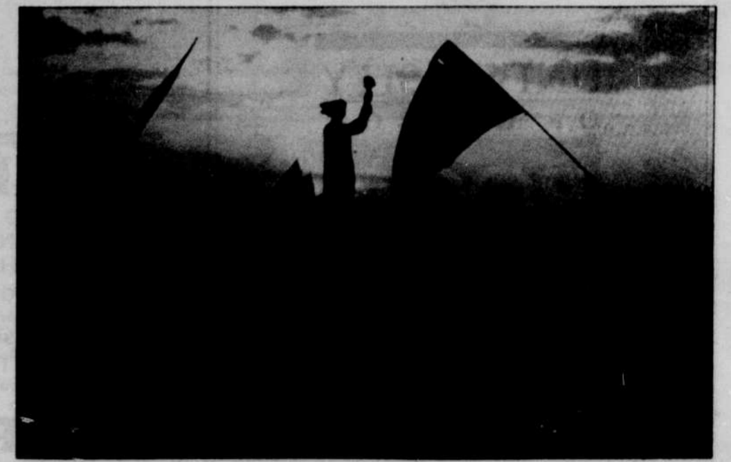
▲ Goddess of Democracy in the twilight symbolizing the dawn of a new era.

PAID FOR BY CHINESE STUDENT AND SCHOLARS ASSOCIATION, UNIVERSITY OF OREGON Donations for victims requested. Make checks payable to CSSU, P.O. Box 3914, Eugene, OR 97403