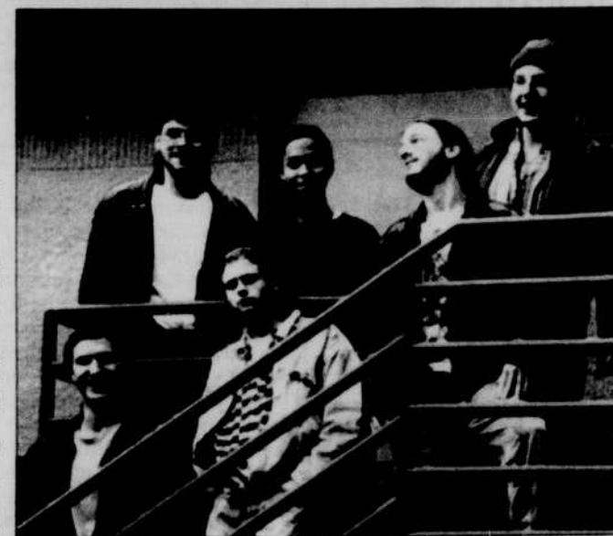
Eugene bands Rabbit Choir (top) and International Anthem (bottom) will join with nine other bands at this year's Give-Peace-a-Dance benefit.