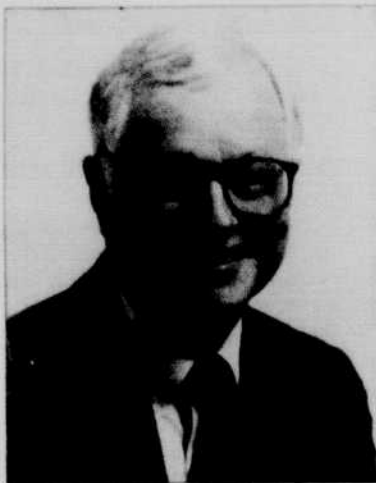
30 years of business and civic experience, endorsed by RIGHT TO PRIVACY