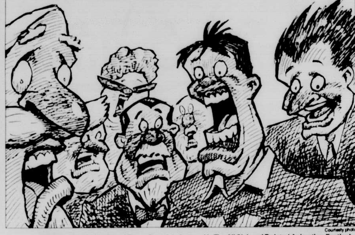
A piece by Bill Plimpton, titled "One of Those Days," is featured in The All Sick and Twisted Animation Festival.