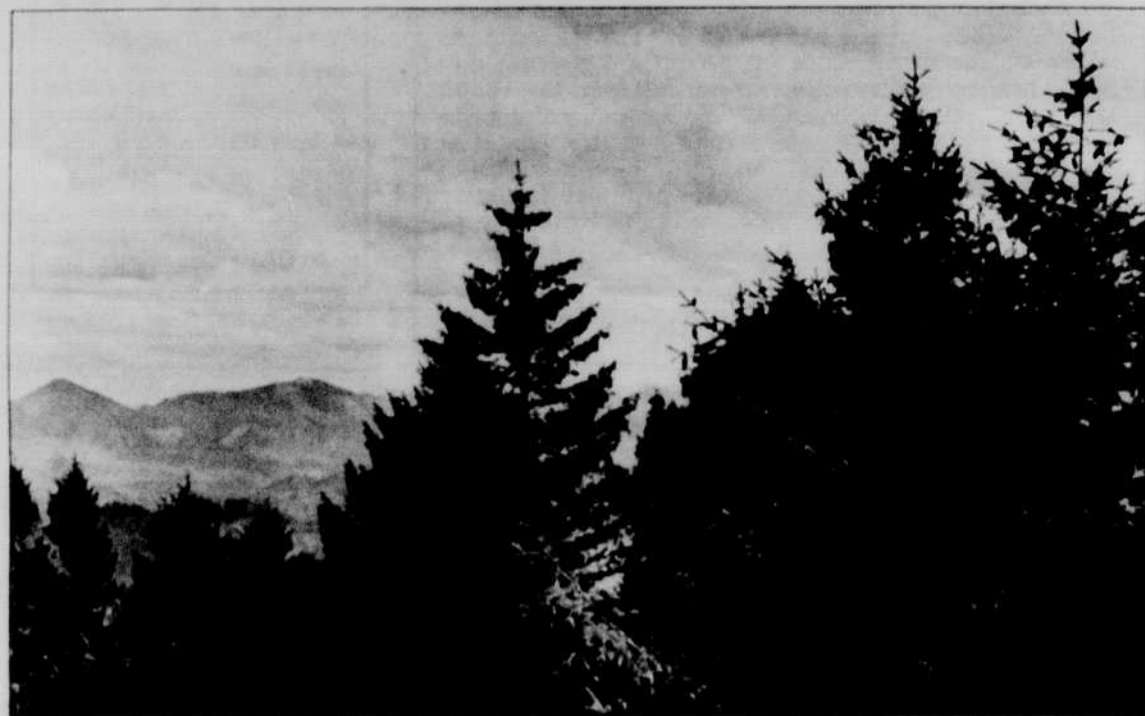
The hike to Larison Rock provides some great scenery of the Willamette Valley.

Drive about a mile east of Oakridge and turn right at the