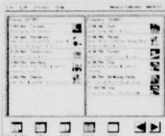
This full-function daily planner, complete with animated reminder icons, makes it easy to keep track of your schedule.

While you're at it, you can organize, view and print out your