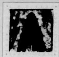
Chart solely based on college radio airplay. Contributing radio stations: KASR, Arizona State U.; KALX, U. of California, Berkeley; KLA, U. of California, Los Angeles; KUCB, U. of Colorado; WXDU, Drexel U.; WUOG, U. of Georgia; WIUS, Indiana U.; WXJM, James Madison U.; WRHT, U. of Kentucky; WLIC, Loyola U.; WVUM, U. of Miami; WCBM, U. of Michigan; KCOU, U. of Missouri; WNYU, New York U.; WXYU, U. of North Carolina; KTRU, Rice U.; WIDB, U. of Southern Illinois; KTSB, U. of Texas; WTUL, Tulane U.; WAKE, Wake Forest U.; KCMU, U. of Washington