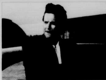
Rebellious Rourke 18

A COLLEGE GUIDE TO UNLIMITED ENTERTAINMENT