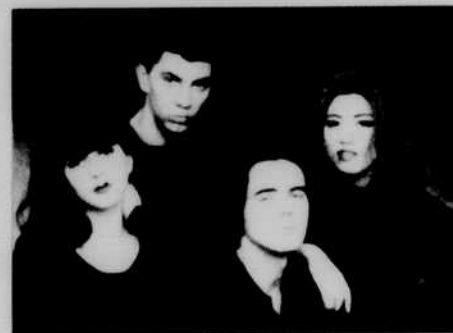
A Lushous creation 19