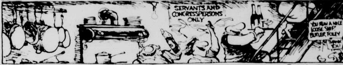
WHILE THE OWNERS WERE ABSENT, THE SERVANTS OF THE PEOPLE HAD A WILD OLD PARTY UPSTAIRS.