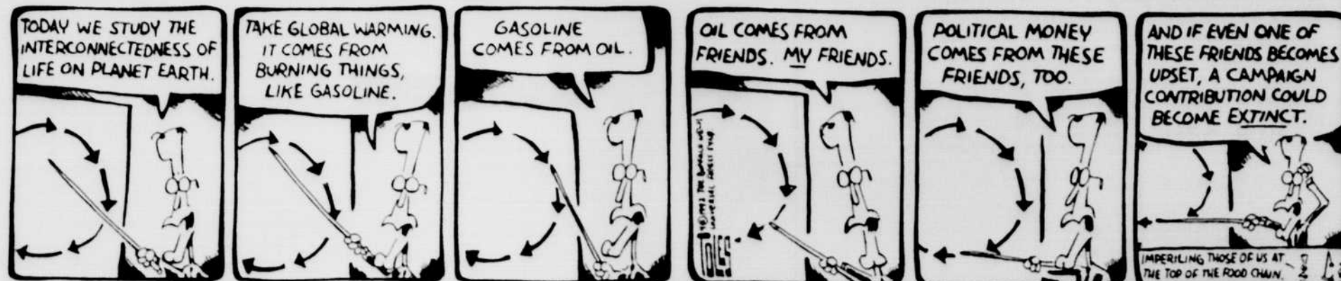
Oregon Daily Emerald Monday April 6, 1992 2