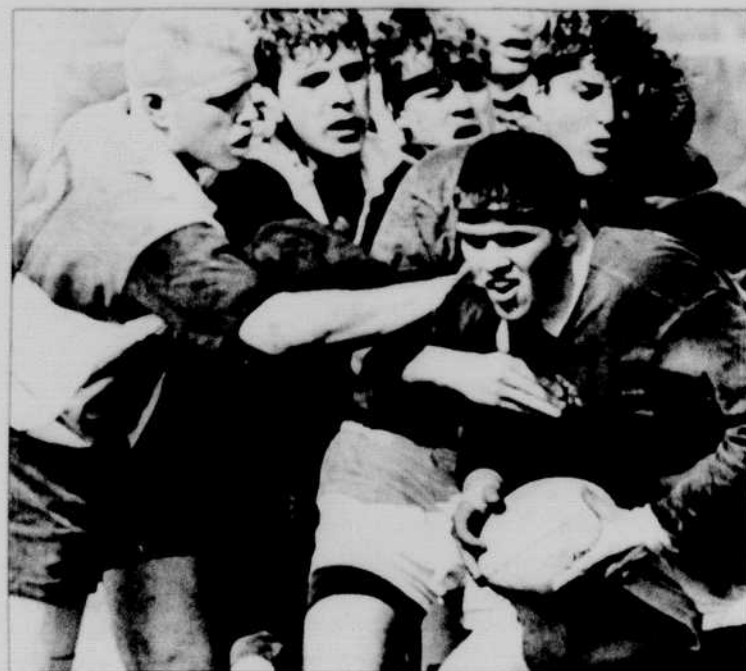
Despite a bleak winter, the Ducks came back with a 24-7 victory over Washington State Saturday, advancing the team to the playoffs.

Oregon's worst example of this came against Central Washington, when the Ducks blew a 16-0 halftime lead. The Ducks fell behind 18-16 before scoring late to win it 22-18.