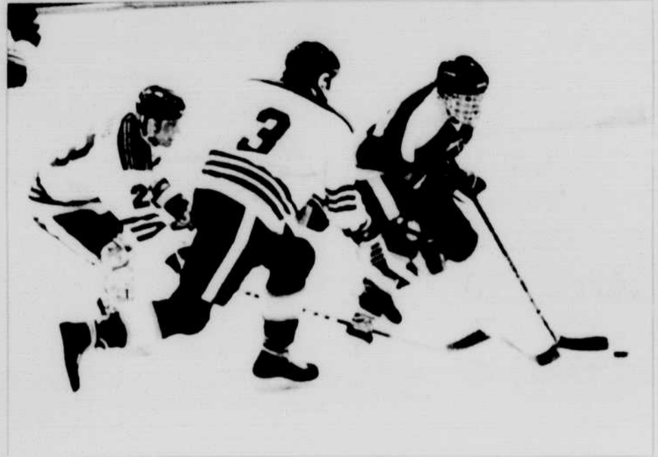
The Cold Ducks finished the season in second place in the Hockey West League with two wins over Gonzaga this weekend.