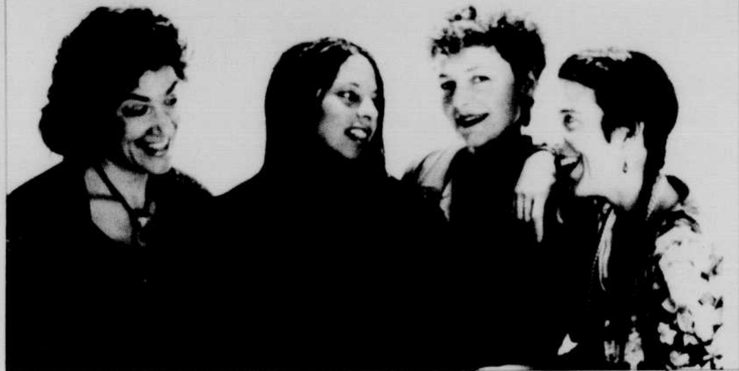
Members of Seattle's "outrageous" feminist band, Venus Envy, will perform at the Lane County Fairgrounds March 7. Doors open at 7:30 p.m., and tickets are $8 to $10.

Friday from 6 to 9 p.m., a potluck will be held in the Koinia Center with two women speakers from India and Kenya.