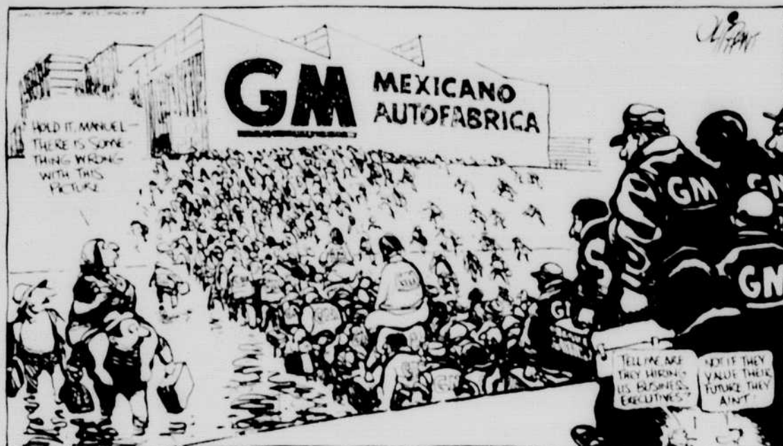
THEIR DOMESTIC ECONOMY A SHAMBLES, WORKERS STREAM ACROSS THE RIO GRANDE IN SEARCH OF WORK.