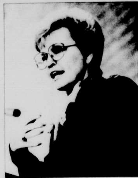
Gov. Barbara Roberts