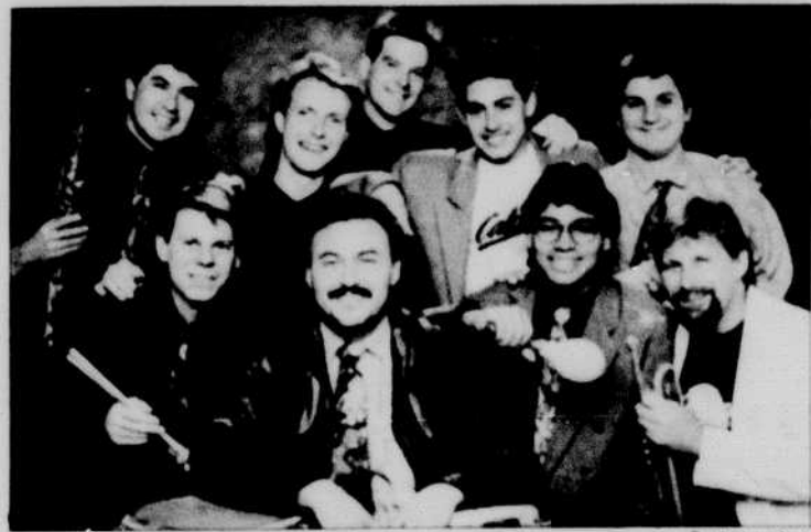
Eugene band Caliente will perform its own brand of salsa music at Los Baez, 85 Oakway Center, on Valentine's Day.

Caliente plays many salsa favorites as well as new material that will make any crowd want to get up and dance — even if concert-goers aren't familiar with meringue dances.