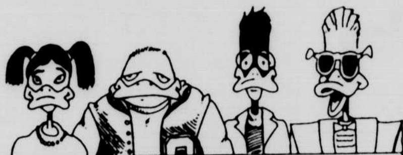
THE DIET PEPSI'S