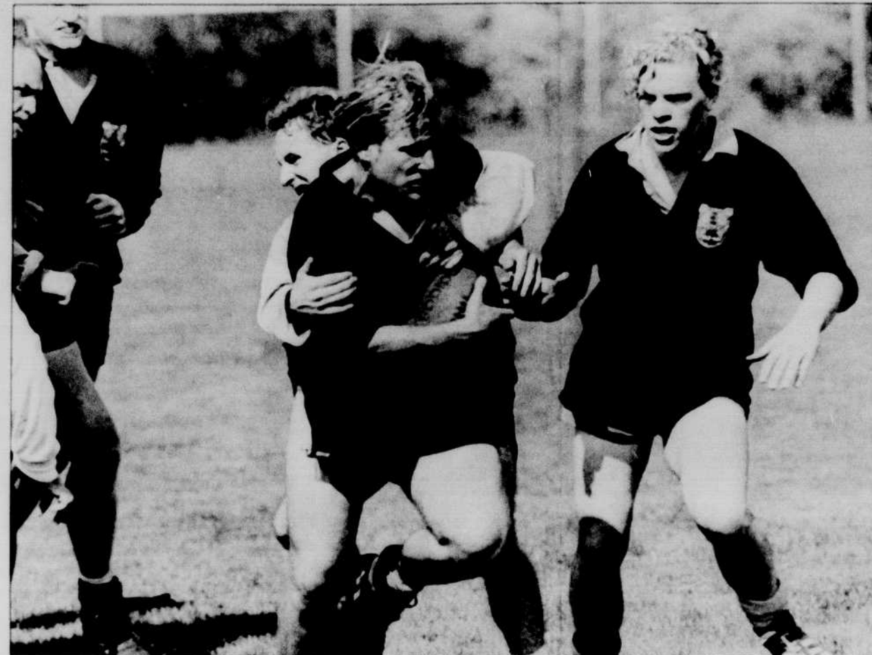
Students can choose from a variety of teams, including rugby, to join through Club Sports.

petitive, and some teams are forced to turn away prospective members because of size limits, the program really does offer something for just about everyone.