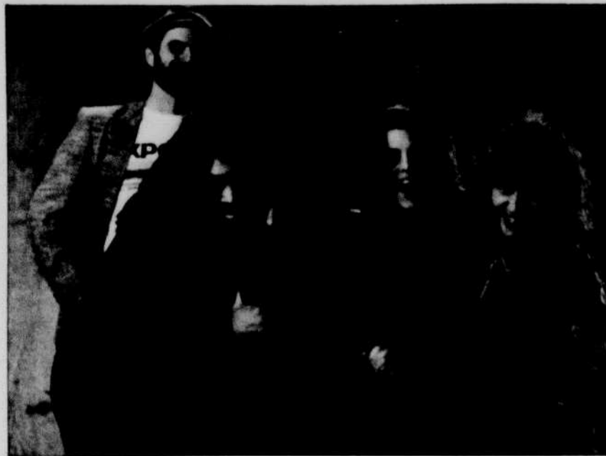
Dub Squad, a danceable reggae band, will perform at the WOW Hall tonight.

Dub Squad will perform with Black Roses tonight at the WOW Hall, 291 W. Eighth Ave., at 9:30 p.m. Tickets are $6 in advance at the EMU Main Desk or $7 at the door.