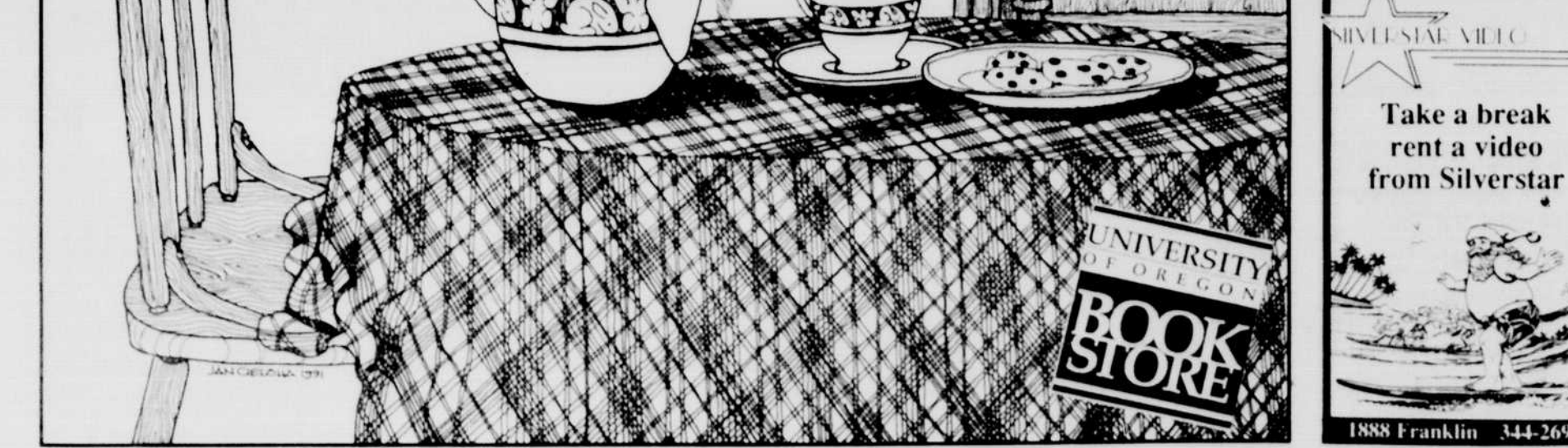
10 Oregon Daily Emerald Friday, December 6, 1991