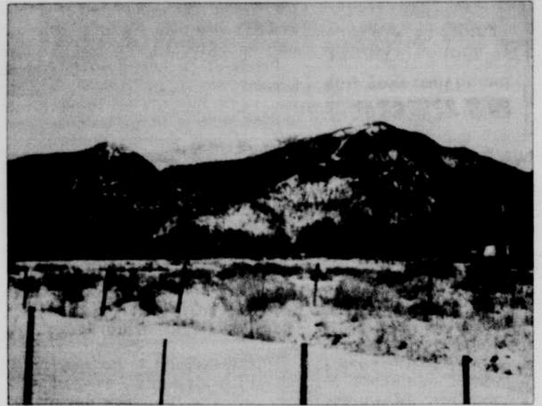
Anthony Lakes area in Eastern Oregon offers unique cross-country ski trips in a picturesque setting much different from the Cascades.

The easiest way to start this trek is to pay $6 for a one-time ride to the top of the ski lift. From there, follow the top of the ridge south to the Crawfish Basin trail, which winds around the south slopes of Lee's Peak above expansive