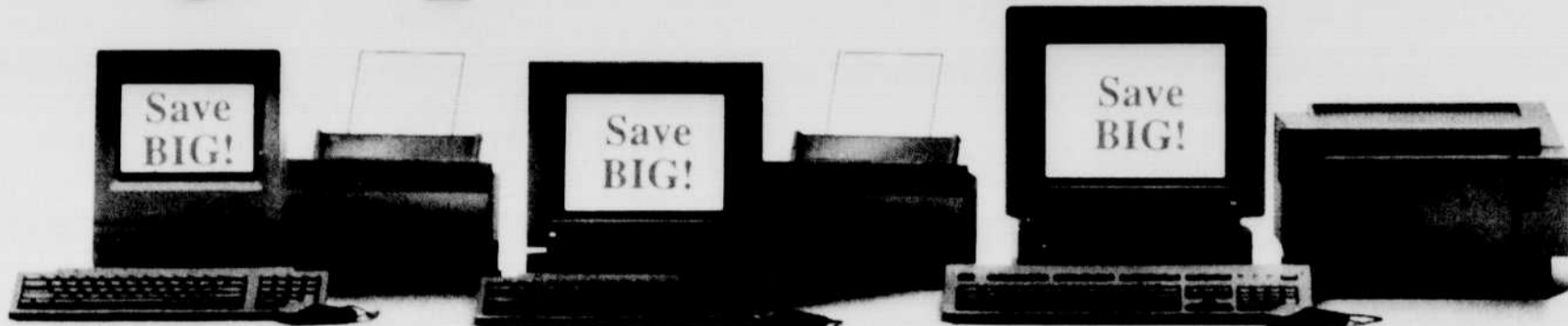
Macintosh Classic* System.