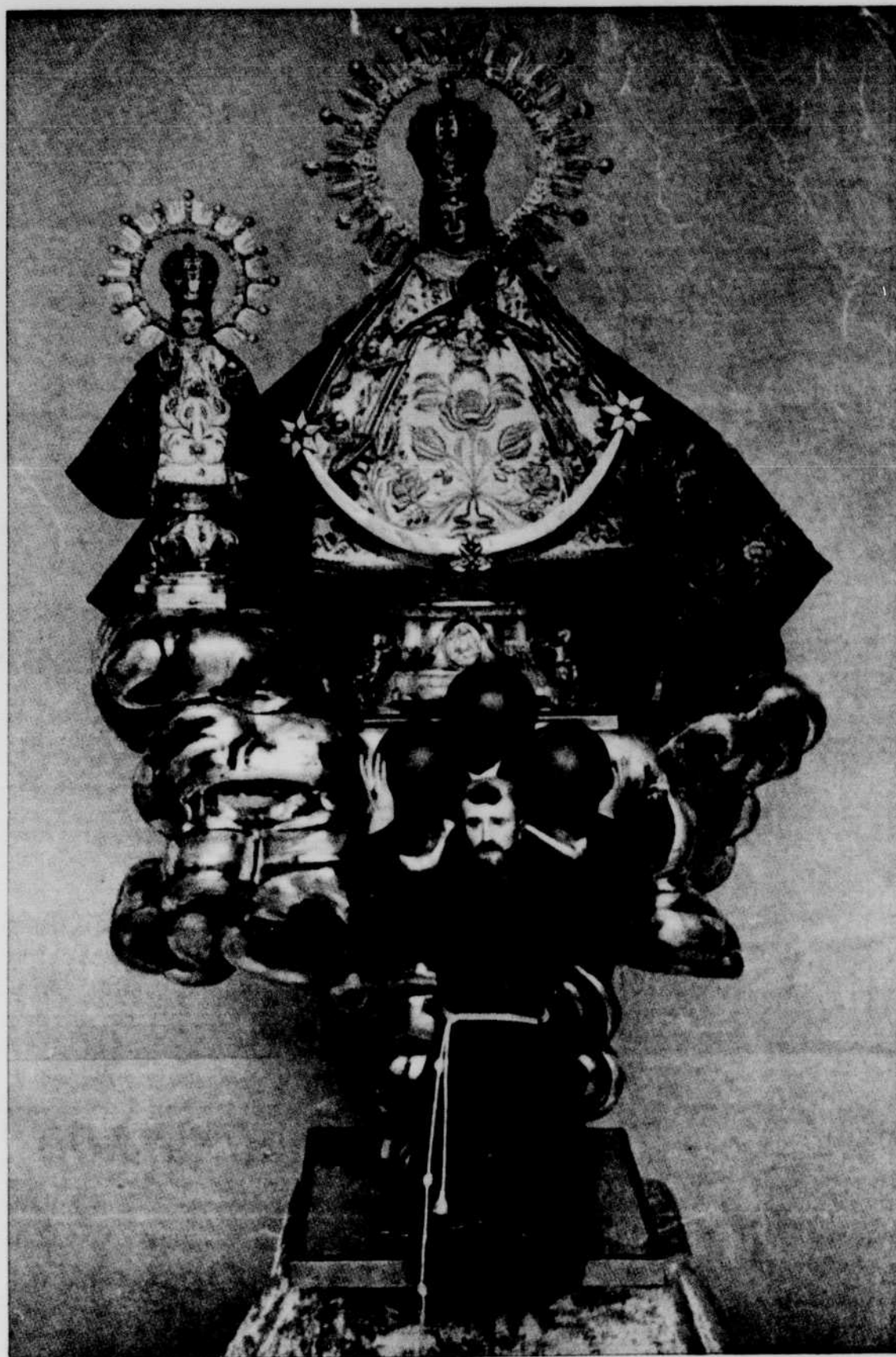
The statue of Santa Maria del Pueblito, a representation of the Patron Saint of Queretaro, stands as a symbol of the Catholic faith.