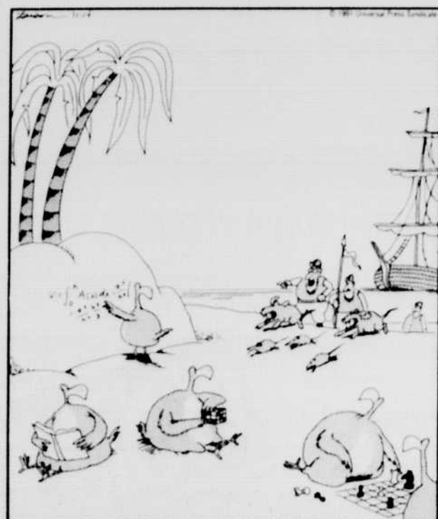
Unbeknownst to most ornithologists, the dodo was actually a very advanced species, living along quite peacefully until, in the 17th century, it was annihilated by men, rats and dogs. As usual.