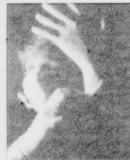
The tricks of treating.

Call our toll-free number today to vote yes or no.