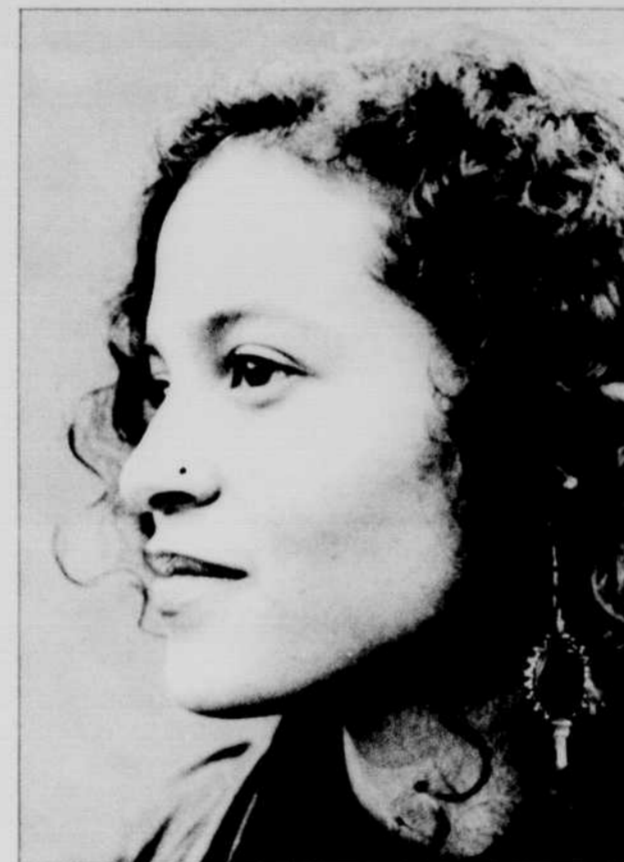
Nose rings and other forms of body ornamentation are enjoying increased popularity.

nose rings worn by Nepali women are part of the country's Hindu tradition.