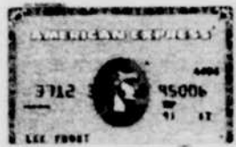
Membership Has Its Privileges®

So get the Card. And get ready to cover new territory on either side of our Great Continental Divide.