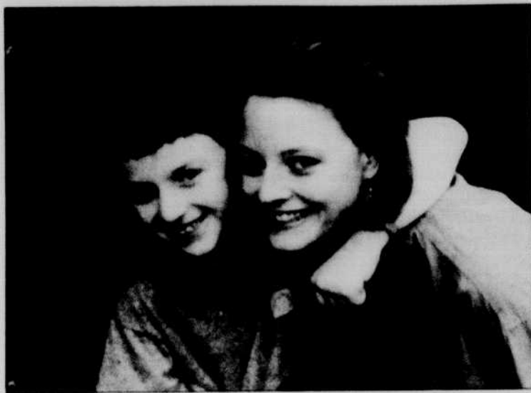
Jodie Foster, as Dede Tate, and Adam Hann-Byrd, as Fred Tate, fill the screen with a story of ordinary and extraordinary people.

ADMIT ONE As a former staple of Disney films and former child actress, Jodie Foster was known to act in simple flights of fancy. Now, as director of Little Man Tate , Foster has grown to present a mature, heartfelt film of importance.