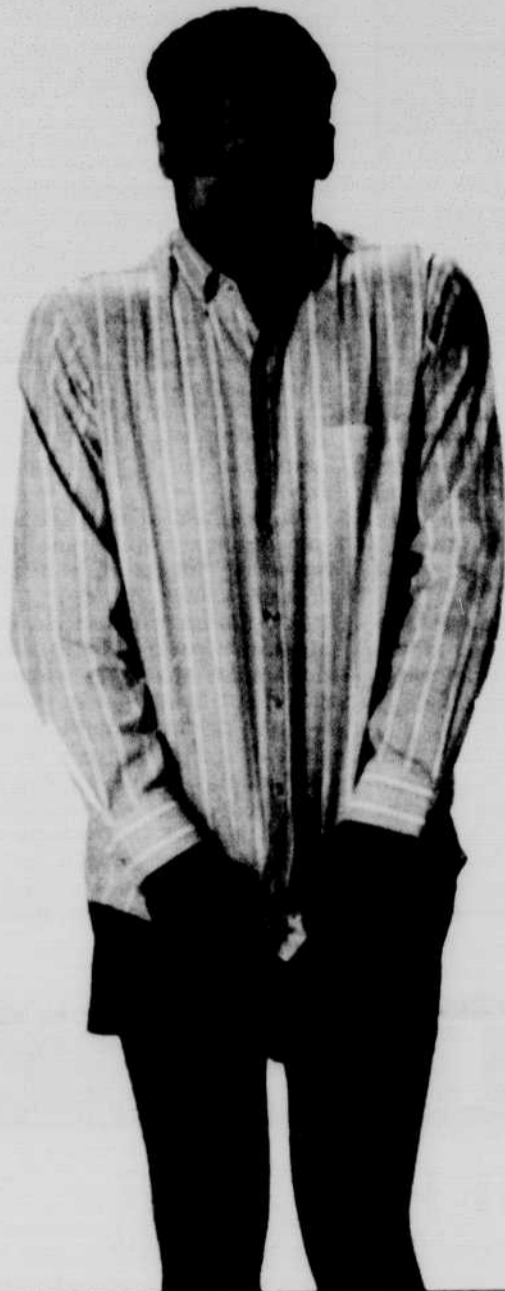
Man on the left -

Nice shirt! But your money's spent. And you can't go far dressed like that. Activities cease and they won't pick up until you pick up some pants. In certain circles, style has a way of slowing things down.