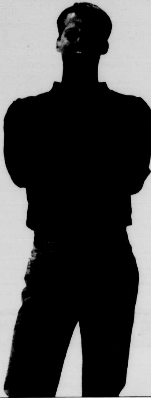
- Man in the right

Completely dressed in 100% cotton basics from Fred Meyer. Pants and shirts you can live with. And prices that let you get on with life. Looking good will always be a priority. Achieving it is easy at Fred Meyer.