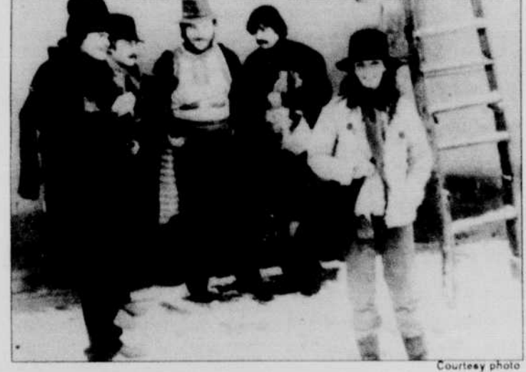
Muzsikas, a Hungarian folk band, will perform Friday at 8 p.m. in Beall Hall at the University School of Music. Tickets are $5 for students and $8 for general admission.