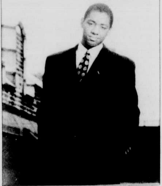
Acclaimed saxophonist Branford Marsalis will perform two shows tonight to kickoff the Cultural Forum's 1991-92 Concert Series.

I book for students and with the increasing interest in jazz. I thought it was important to get the