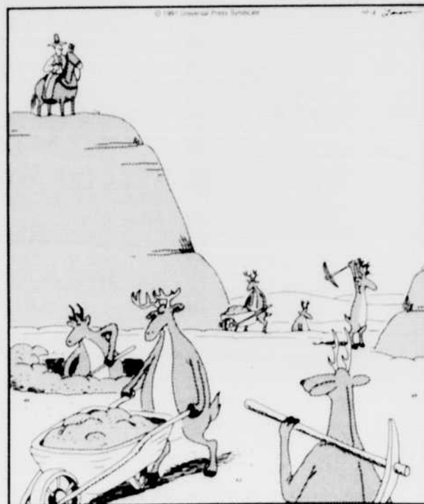
Where the deer and the antelope work