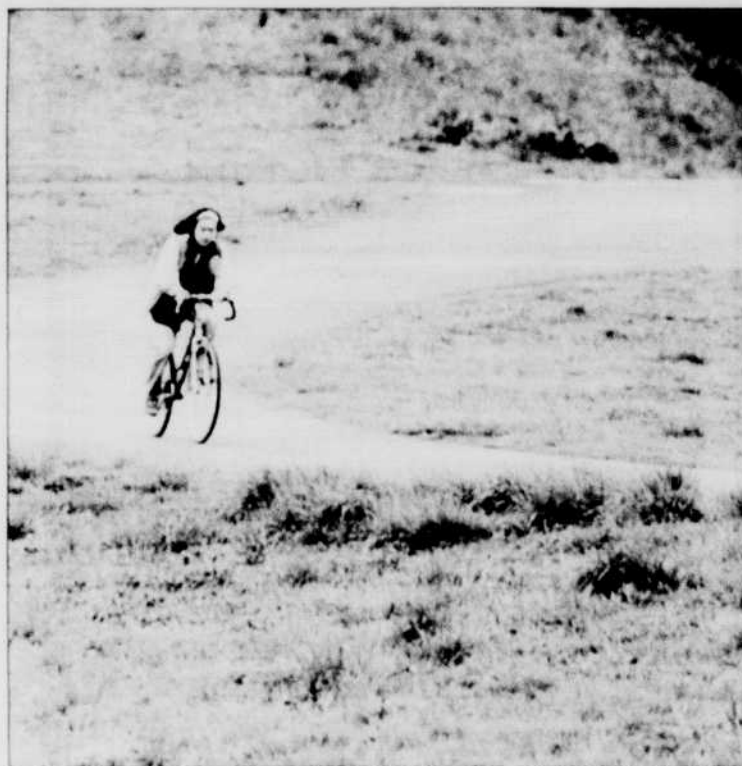
A lone biker makes her way through the proposed site of a 150-acre golf course in Alton Baker Park.

The Lane County Commissioners are scheduled for further discussion on whether to proceed with plans for a golf course Oct. 10.