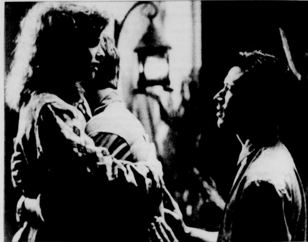
Colleen Flynn is reunited with her long-lost uncle, Peter Berg (left), and her father, Brian Wimmer.