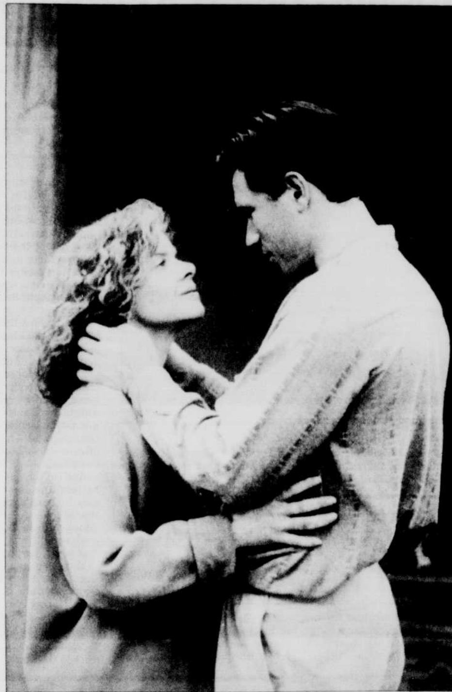
Marcia Gay Harden and Brian Wimmer try to recapture their love after 29 years.