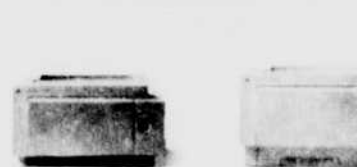
Apple Personal LaserWriter LS Apple Personal LaserWriter NT

Save the most when you buy a high-performance Macintosh IIx computer with either an Apple Personal LaserWriter LS or an Apple Personal LaserWriter NT printer.**