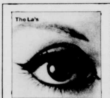
The La's ★★★★

The La's untitled debut album is one of those rare treasures that we get in the mail-room. Admittedly, the four-member band from Liverpool's name doesn't point to a gold mine of creativity, but the music on the album does.