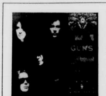
L.A. Guns Hollywood Vampires ★★

The talent displayed on songs like "I Found You" and "Crystal Eyes" could be put to better use if the members of the band concentrated less on "making it" via the status quo, and more on carving out their own niche in the rock world.