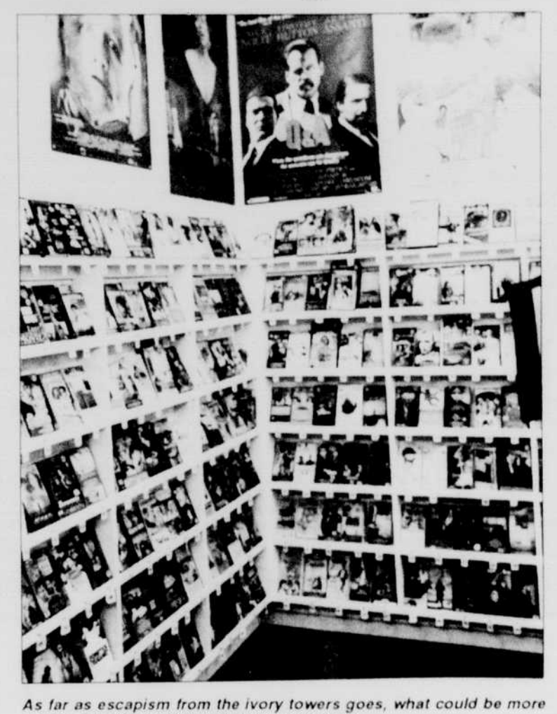
appropriate than a video about campus life?

9: Revenge of the Nerds - A fraternity movie for those who hate frats. You may like it even if you love frats. It's a great campus fantasy movie wherein