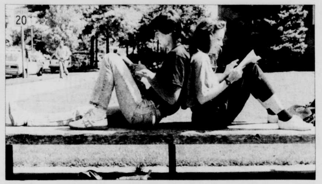
Although many benches on campus lack wooden back supports, these students have found a nov-