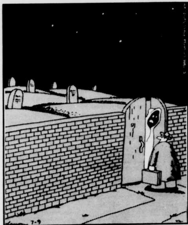
"Sorry ... we're dead."