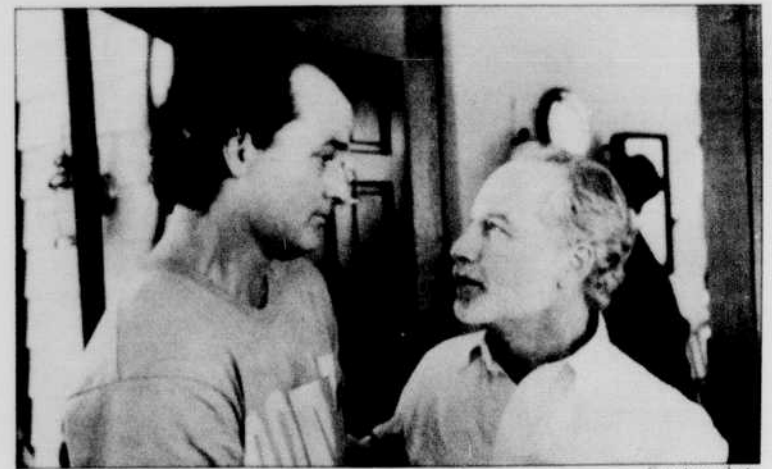
The pathetically helpless and comical Bob Wiley, played by Bill Murray (left), torments Dr. Leo Marvin (Richard Dreyfuss), a stressed-out shrink whose vacation is ruined by the relentless Bob.

Dreyfuss and Murray are great together. Their combined energy