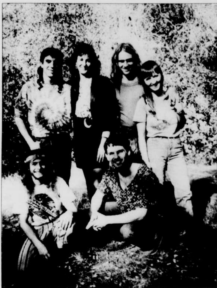
Clan Dyken, a group composed of members of the Dyken family, performs tonight at W.O.W. Hall at 9:30 p.m.