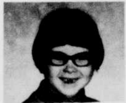
Love the "other" "4"

KAΘ Guess which KAT is a Puurrrrfect "21"?