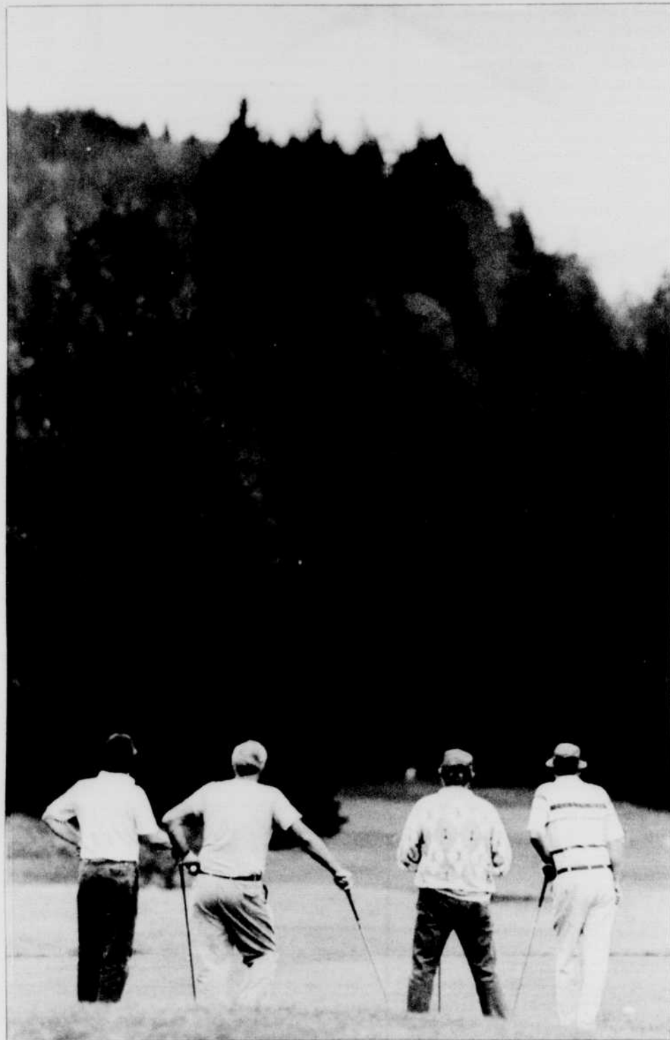
The Three Sisters Mountains are in plain view for golfers on Tokatee's back nine.