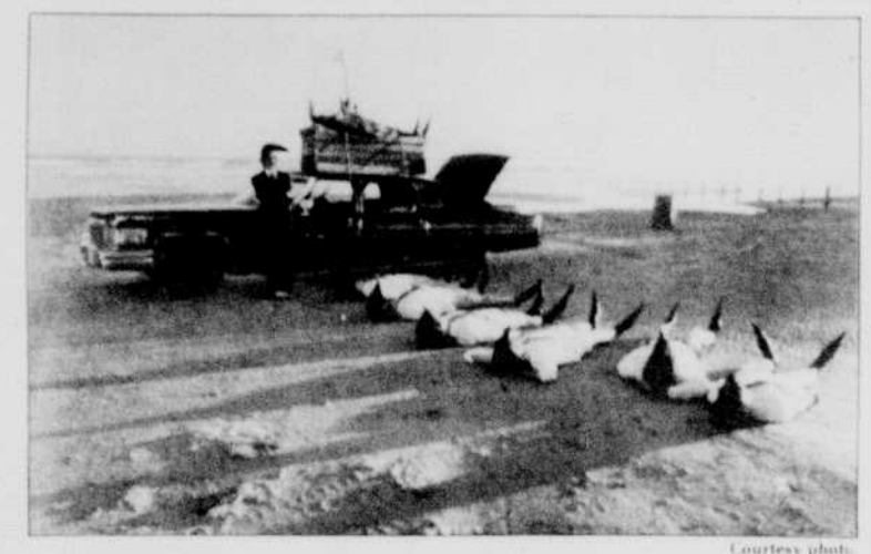
Neat hairdos and cool shoes are just two reasons to go see the new foreign film Leningrad Cowboys Go American.

The camera often remains stationary for long periods of time, simply recording events as they happen. This serves to bring the audience closer to the acton and more involved. It's interesting how these techniques usually