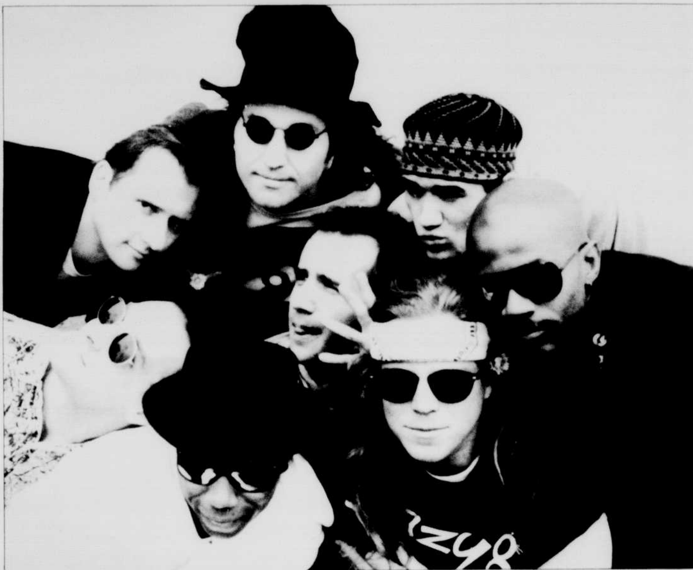
The Crazy 8's will perform tonight at W.O.W. Hall at 9:30 p.m.