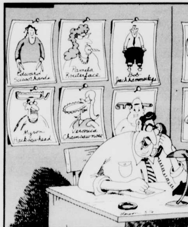
"Al's All-in-One Acting Agency and Construction Company ... May I help you?"