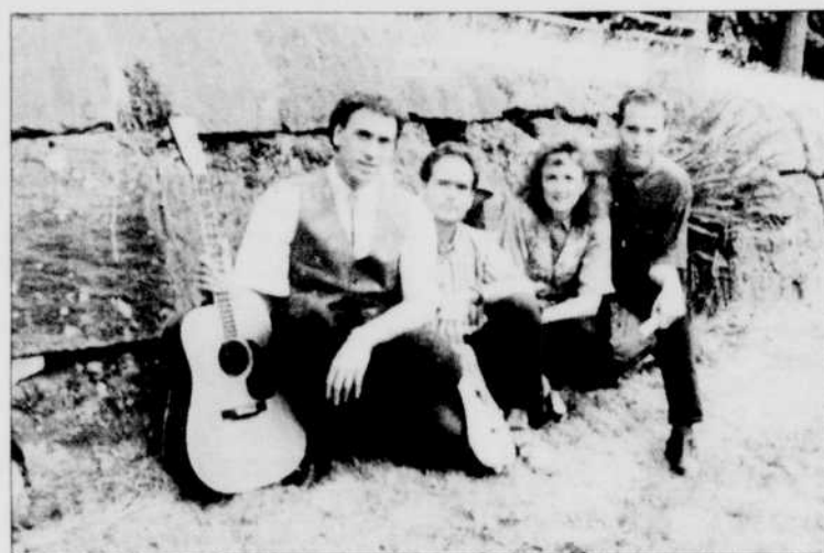
The Tracey's perform Friday at 2 p.m.

The Tracey's have performed in numerous Willamette Valley markets, fairs and festivals during the past three