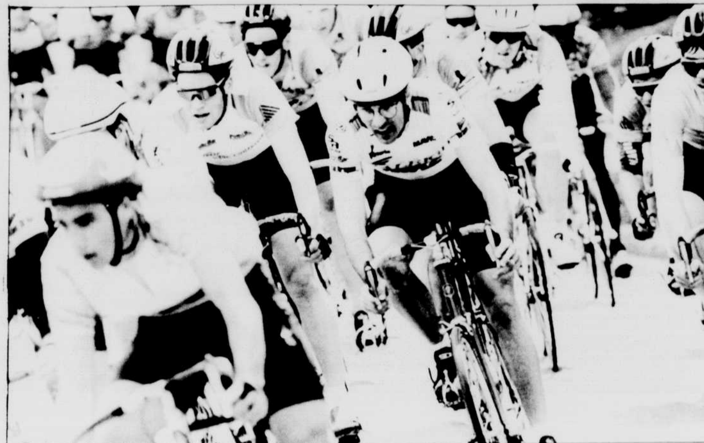
The Club Sports cycling team races by the EMU Courtyard on a Saturday morning.