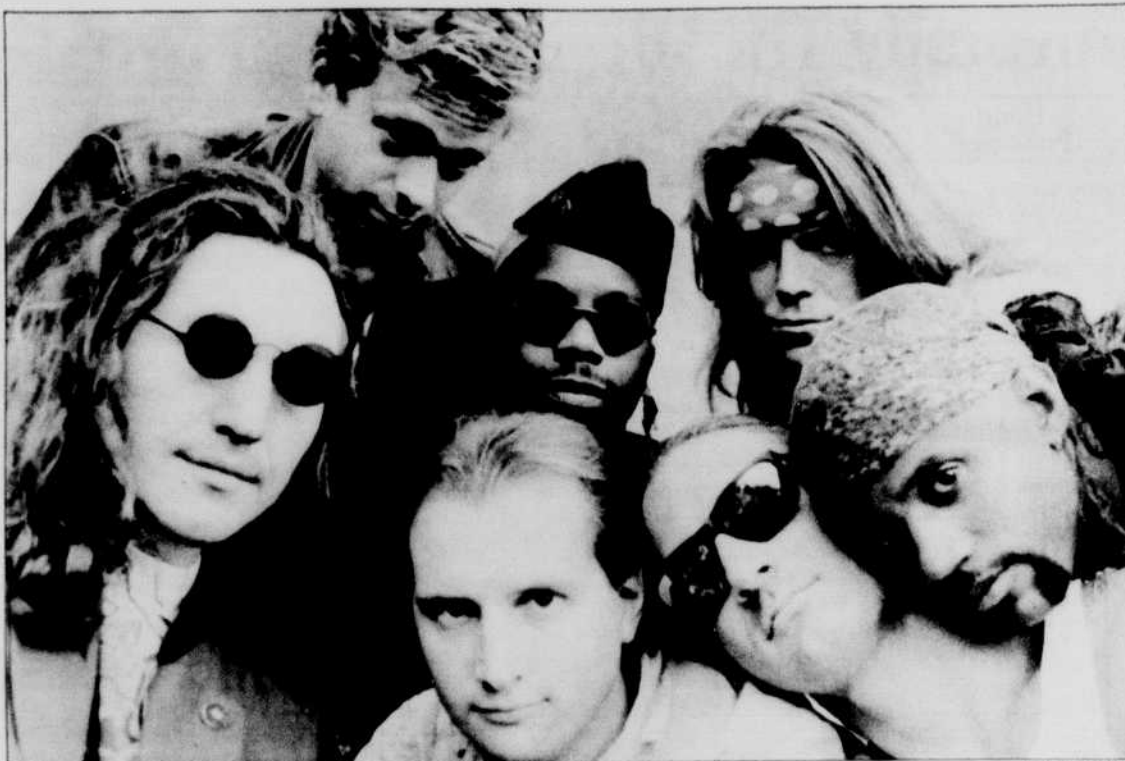
The Crazy 8s will be performing in Eugene this weekend as part of the band's ninth anniversary celebration. The show will take place at 9:30 Friday night in the Community Center for Performing Arts (W.O.W. Hall), 291 W. Eighth Ave.