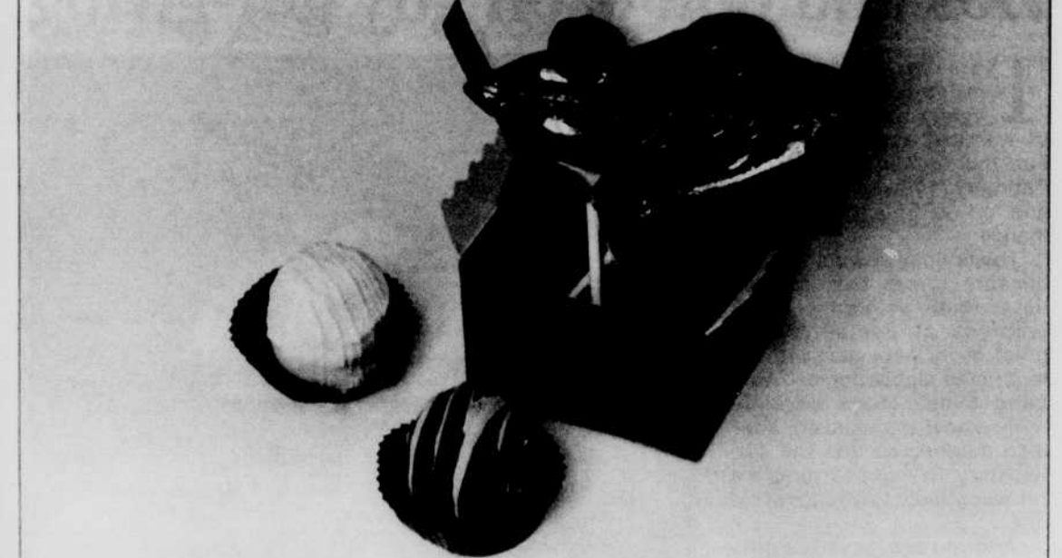
Chocolate, always a big seller at Valentine's Day, has been mythically known to make one feel as if in love.

877 E 13th • 343-2488 open M-Sat (next to U of O Bookstore) 9-5:30 M-F 9-5 S